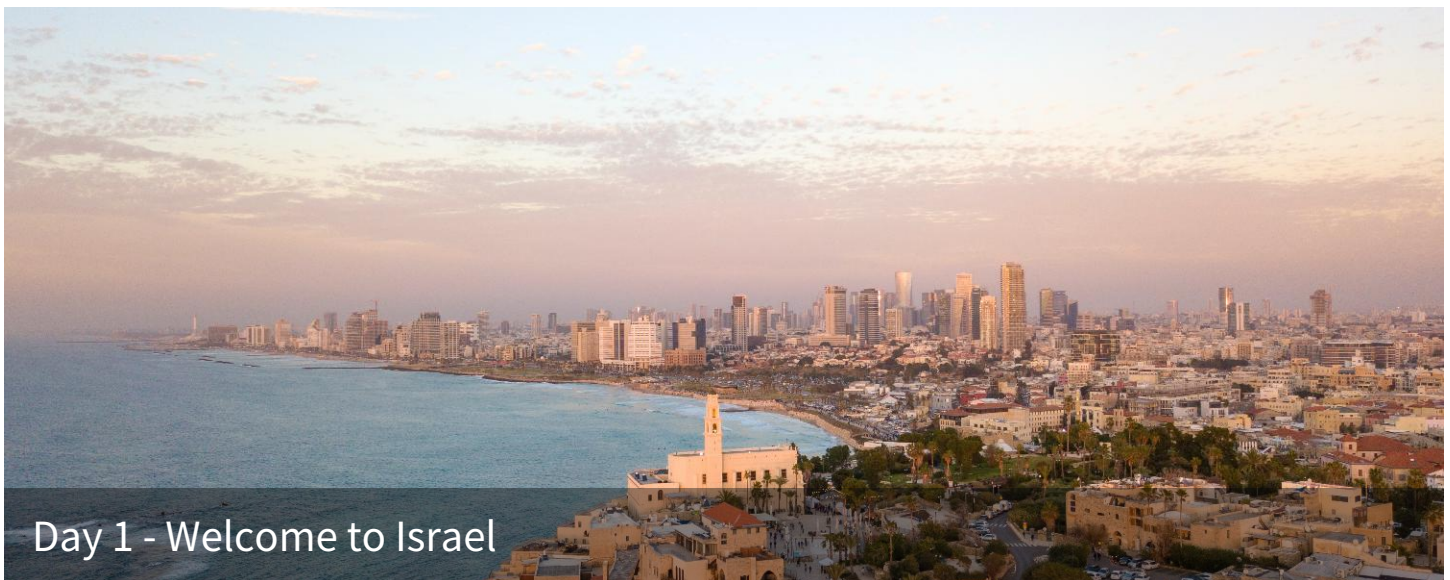
Day 1 - Welcome to Israel

We depart from London and fly direct to Tel Aviv. On arrival we meet our local Israeli tour guide and coach driver. We then transfer to the Metropolitan hotel in Tel Aviv to check-in in time for evening dinner and overnight stay.