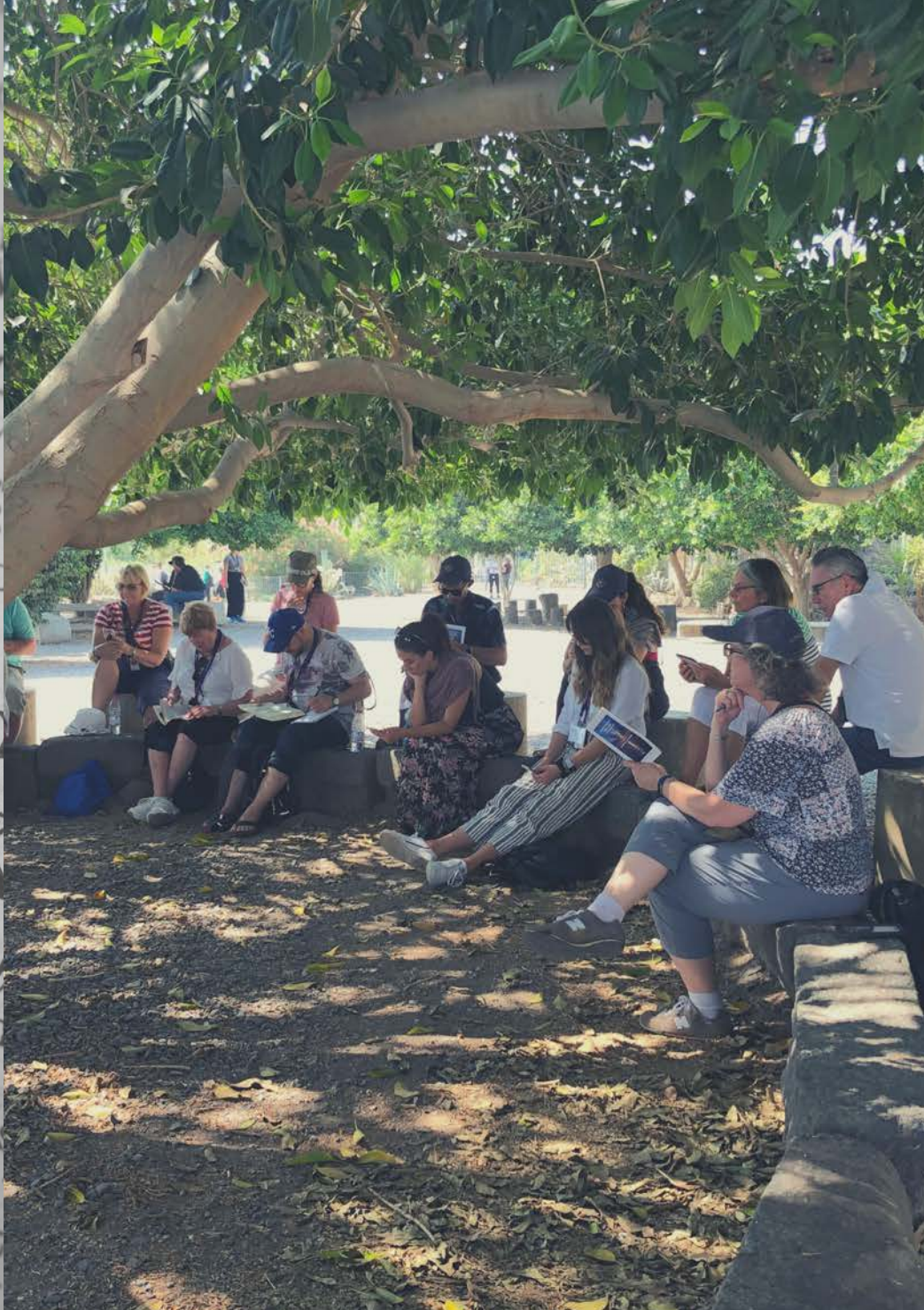
BIBLE STUDY BY THE SEA OF GALILEE - 2019 TOUR GROUP

As for four the face of a lion. and they four on the left